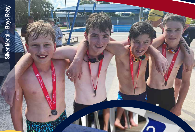
Silver Medal – Boys Relay