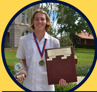
Max Castle Bernard Peavey Memorial