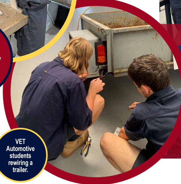
VET Automotive students rewiring a trailer.