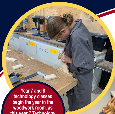
Year 7 and 8 technology classes begin the year in the woodwork room, as this year 7 Technology student carefully marks out her timber before performing a rebate joint.