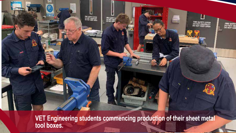
VET Engineering students commencing production of their sheet metal tool boxes.