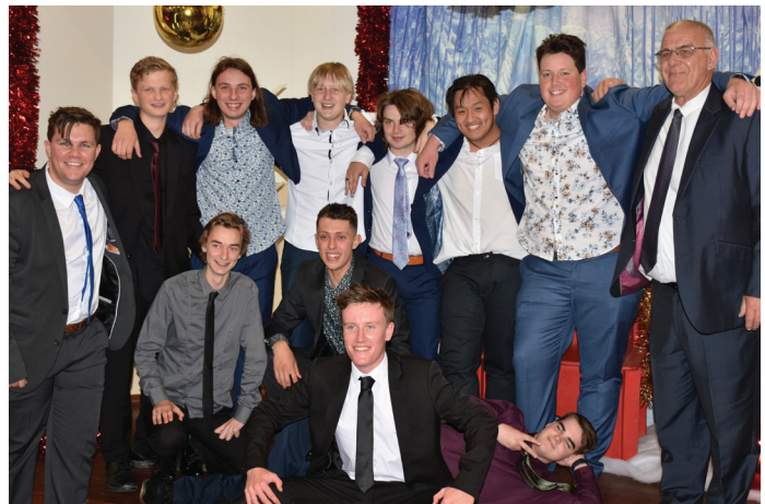
Above and Below - Photographs from the Valedictory