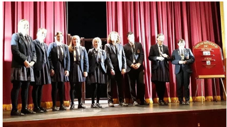
Above and Below - Performances by CCS students at the Yarram Eisteddfod