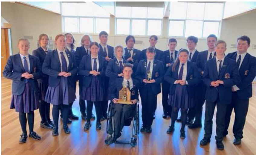
Above - Catholic College Sale Combined Choirs