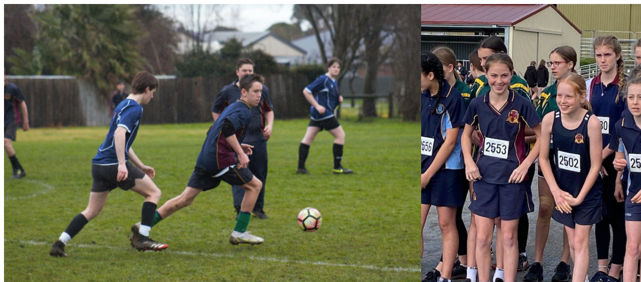
Above - Photos from Senior soccer and SSV Cross Country events held in Term Two