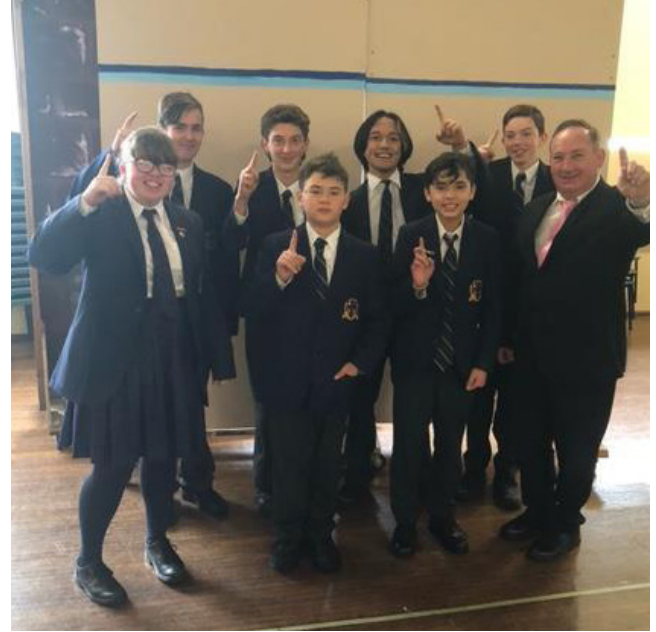
Above - The Concert Band