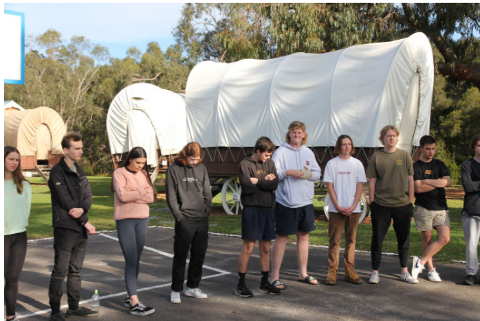
Above - Year 12 Students gather at their Mill Valley Retreat late in Term Two.