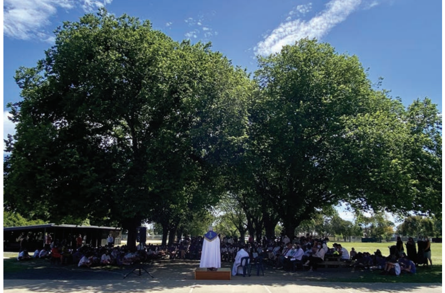
Above - Final Sion Liturgy

The year 8 cohort spent their last Wednesday at Sion looking to how they might become