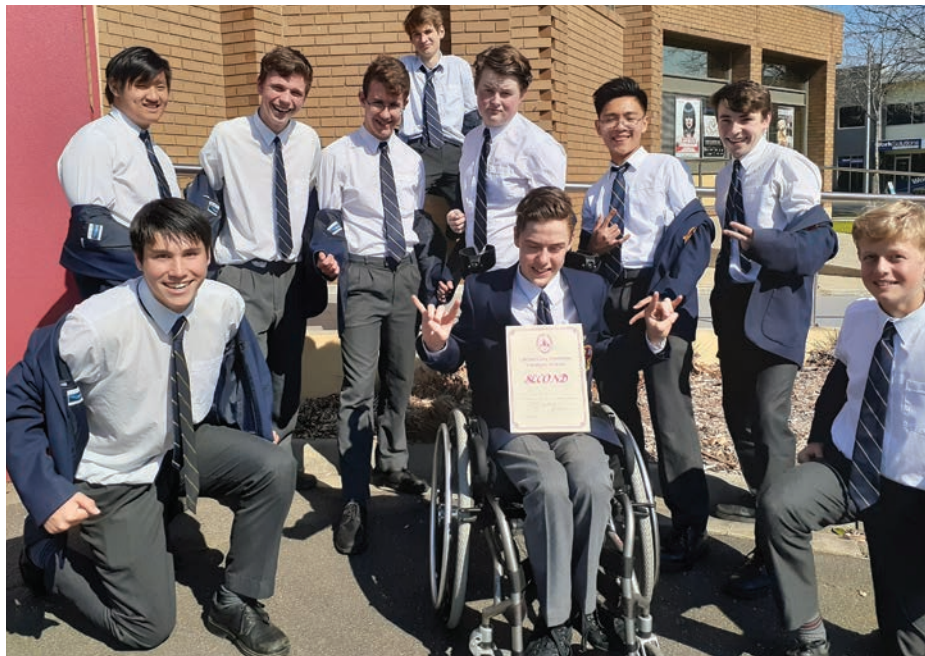
Above: Catholic College Sale MVC Group Below: Sion Singers