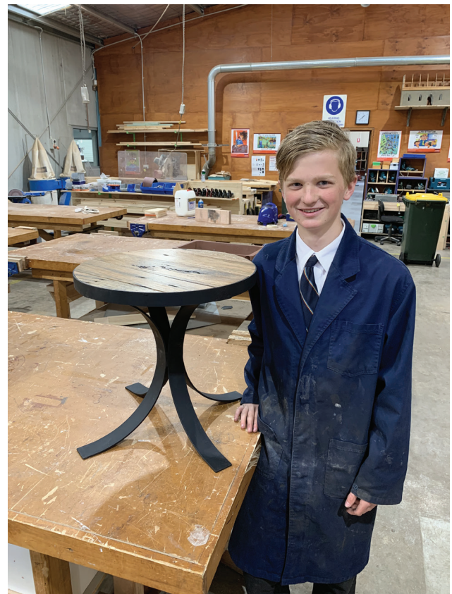
Above - Some completed coffee tables designed and constructed from recycled timber, by the Year 10 Design and Technology (Woodwork Class).