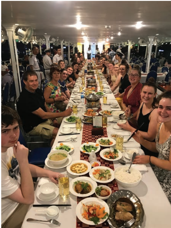
Above: Students and staff on the Vietnam trip enjoy the cuisine on offer in Ho Chi Minh City.

learning progressions will be a key part of our improvement plan for all students over the next four years.