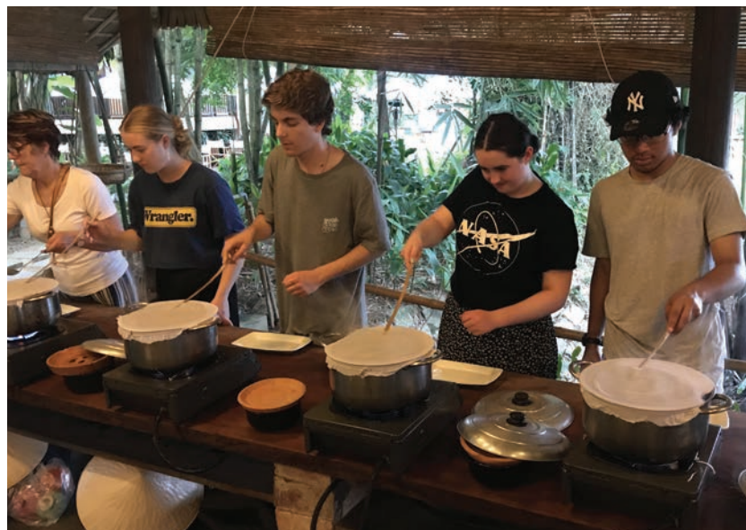
Right - Students testing their cooking skills at a cooking class in Hoi An, Vietnam