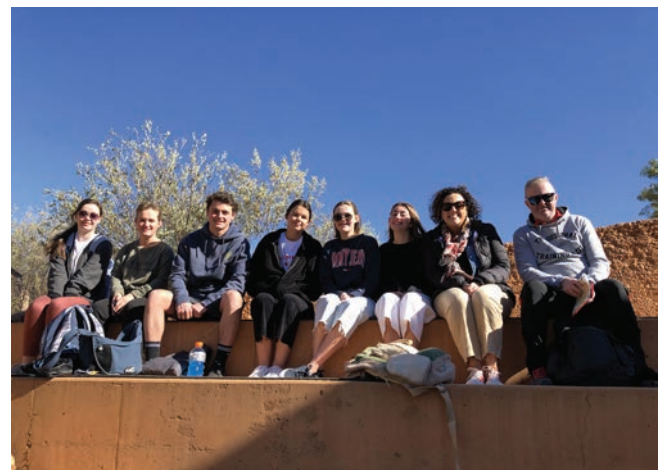
Right - Students and staff on the annual Santa Teresa Immersion.