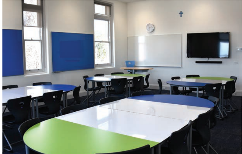
Above: One of the new learning studios in the St. Patrick's refurbishment.