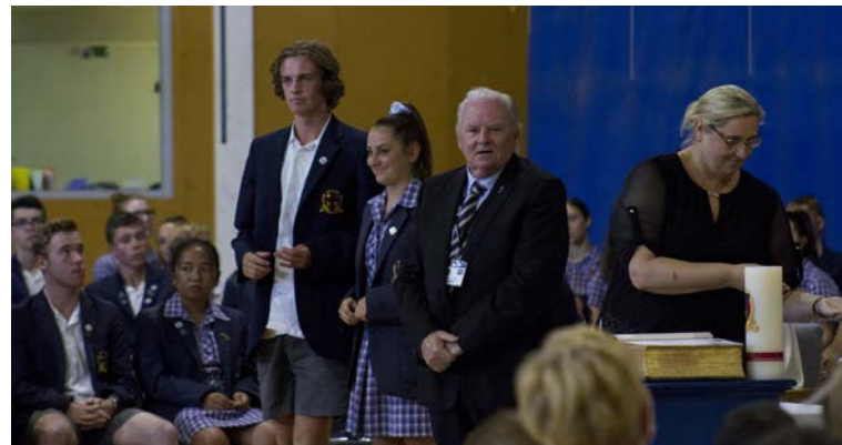
Above: House Captains are presented with their badges.