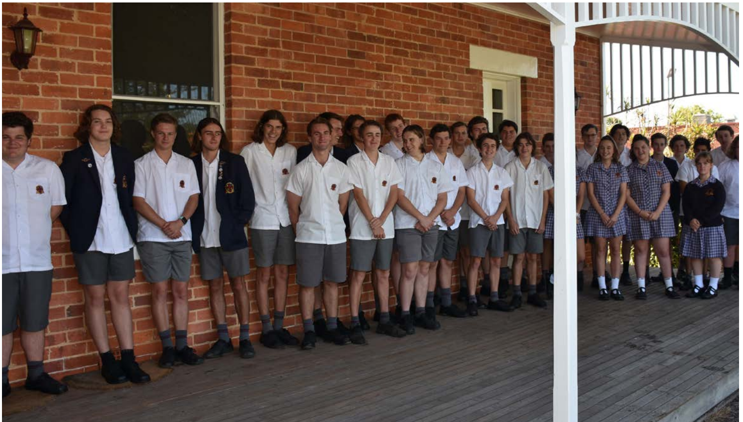
2019 VCAL students in front of the house that will host a large portion of our VCAL classes this year.