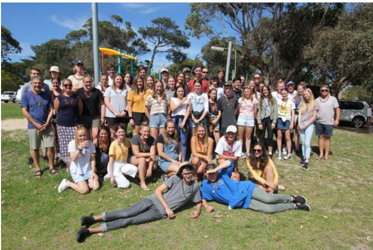
Above - The Tyers Year 12 Retreat group.