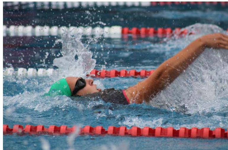
Above - Action from the St. Patrick's Swimming Carnival.